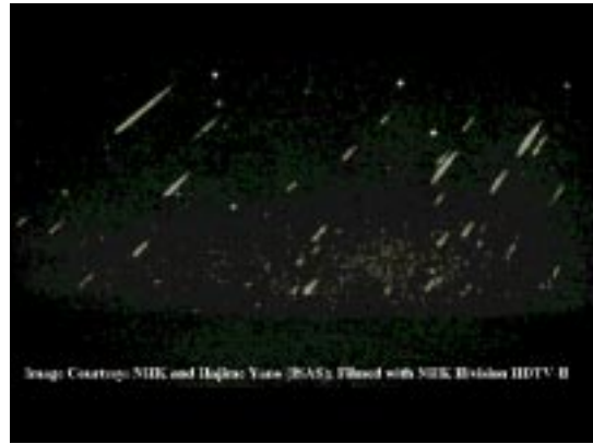
Figure 2: One-minute composite image of the 1999 Leonid meteor shower peak (< 5th mag.) over Europe, imaged with the HDTV-II in 59 x 33 degrees FOV developed by NHK (from Yano et al., [2])

Even flying high in the sky, say 10km altitude, the observation has to be made through the dense of the atmosphere, which brings disadvantage in the ultra-violet (UV) wavelength. If the observation is made from the low Earth orbit, looking down from out of the atmosphere over the night